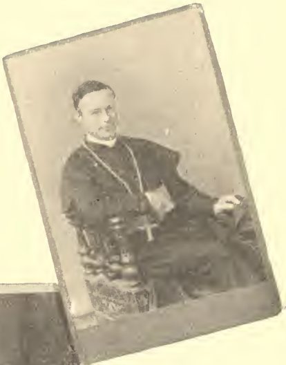
CARDINAL GIBBONS, BALTIMORE.